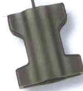
■ Quick Connect-II (Q/C-II)