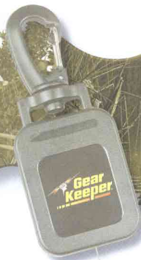
■ Quick Connect (Q/C) w/ Pivot Ball Connection