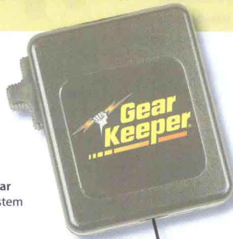
■ Pivot Ball Connection

The wide range of Q/C accessories offer flexible solutions to almost any gear attachment problem. For example, you can now fit all your gear with a Male connector for use with the same retractor. And the stand-alone Female connectors offer a way to easily attach gear when retraction isn't necessary. The system is as flexible as your imagination!