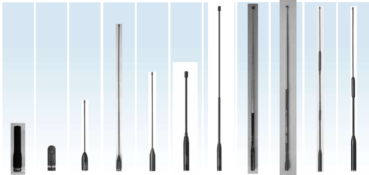
SRHF10 SRH805S SRH815S SRH36 SRH519 SRH701 SRH771 SRH779 SRH789 SRH999 SRH951S