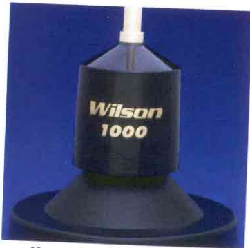
Heavy Duty Magnet Mount

The Wilson 1000 will transmit and receive farther than the antenna it replaces or your money back. This guarantee is good for 15 days from date of purchase.